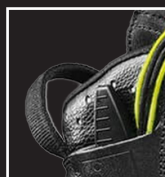
HAIX® Climate System