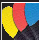
HAIX® Vario Wide Fit System