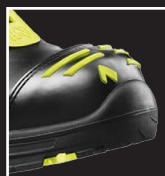
HAIX® High Durability Cap System